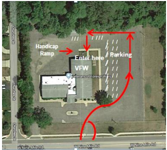
VFW 2645 location

VFW Post 2645 ★ 24222 West 9 Mile Road ★ Southfield, MI 48033 ★ 248-971-5844 Located 600 feet West of Telegraph Road. Entrance is located at the rear of the building.